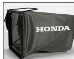
Large Easy-Off 2.4 Bushel Bag (HRR models only)