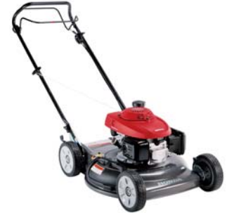
HRS216SDA Self-propelled, side discharge/mulcher