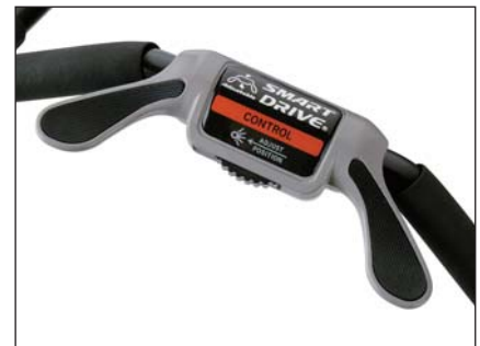
HRR and HRX Adjustable Smart Drive®