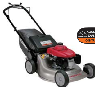
HRR216VKA Honda Adjustable Smart Drive® Variable Speed Transmission, Auto Choke, 4-in-1 rear bagger/mulcher with optional discharge chute and leaf shredder