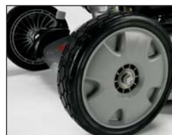
9" Wheels for Easy Maneuverability (VXA only)