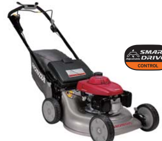
HRR216VXA Honda Adjustable Smart Drive® Variable Speed Transmission, Roto-Stop®, 4-in-1 rear bagger/mulcher with optional discharge chute and leaf shredder