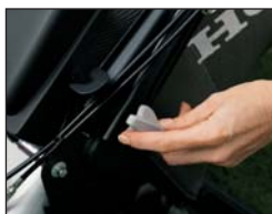
Easy Fold Quick Release Handle (VXA only)

Single Lever Height Adjustment for Rear Wheels Changing mowing heights is easy with this specially designed lever. (VXA only)