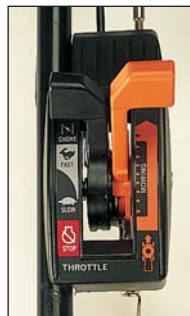
HRX Cruise Control

With Honda, you can choose single speed, or our infinitely variable hydrostatic drive transmissions with Cruise Control or Adjustable Smart Drive®, which allow you to walk at your own pace while easily adjusting ground speed to match mowing conditions.