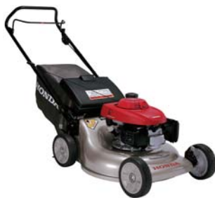
HRR216PDA Push type, 4-in-1 rear bagger/mulcher with optional discharge chute and leaf shredder